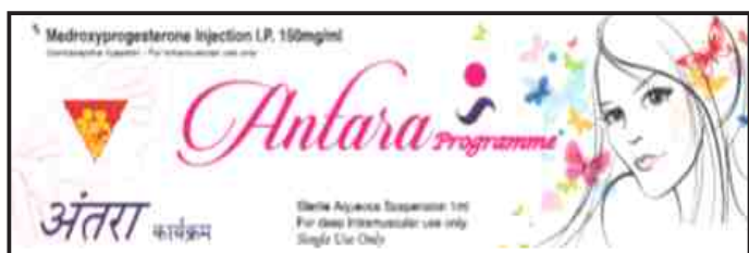
Figure 1: Injectable Contraceptive MPA

MPA is given every 3 months by injection. It prevents pregnancy over a long period of time and helps in achieving spacing between children.