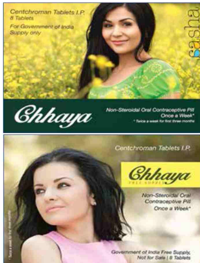
Fig3: Centchroman (Chhaya): a) ASHA Supply and b) Free Supply

Availability: Centchroman (Chhaya) is available in two packages: ASHA supply and free supply. Each pack contains 8 tablets. ASHA supply is for home distribution and free supply is for distribution at health facilities.