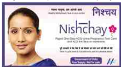
Figure: Pregnancy Testing Kit (Nischay Kit)